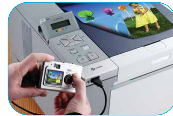
Connect and print photos directly from your PictBridge-enabled camera