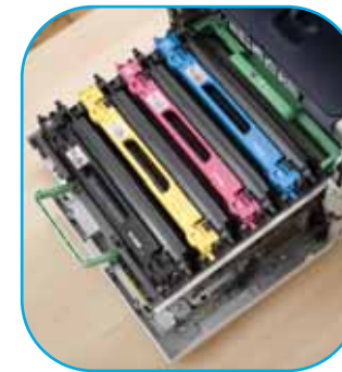
Toners & Drum