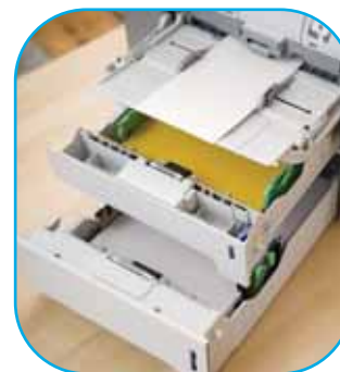
Paper Input Trays

The HL-4040CN and HL-4050CDN are designed for full frontal operation. This means that changing of consumables and loading of paper are all done through the front of the printer, giving you a greater level of convenience.