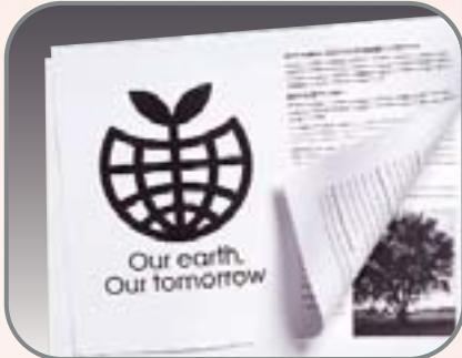
Paper saving double-sided printing