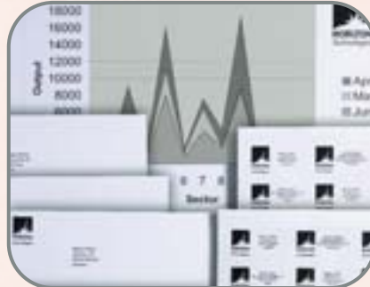
Superb quality printing on a wide range of paper types, transparencies and envelopes